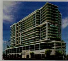
BC Architects: Regency Condado Plaza, Puerto Rico